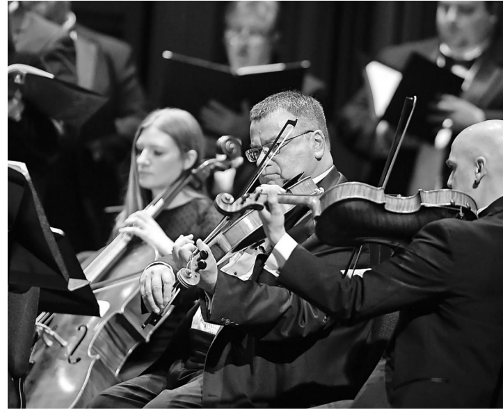
A violinist performs with the orchestra during scene two as The Villages Philharmonic Orchestra opened the 2018-19 season with "Messiah" at The Sharon on Tuesday.